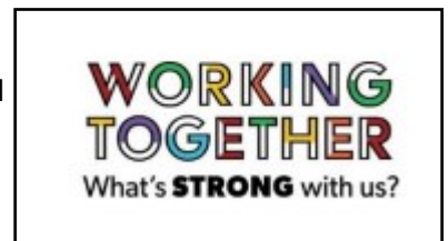
Photo above: The theme for the 2022 Provincial Mental and Well-being Spring Symposium was "Working Together, What's Strong with us?"