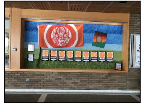
Photo above: The Residential School Survivor's flag in the Barry Sharpe Foyer at the YRHS.