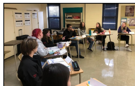
Photo above: Grade 11 students participate in the Mental Health First Aid training.