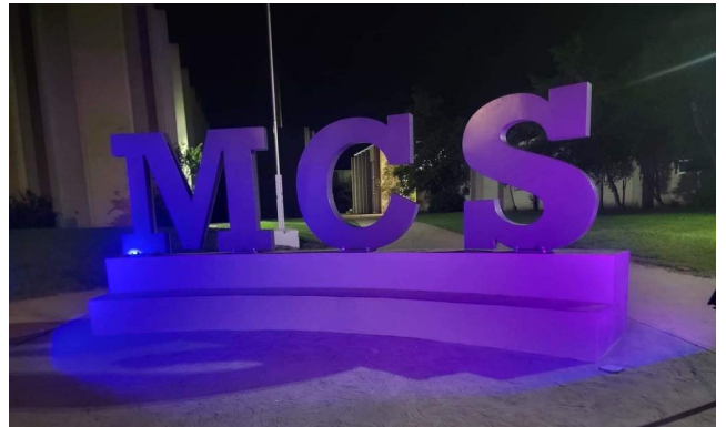
Photo above: The new MCS monument has purple lights on in the evening, letting that Cobra pride shine!

The committee also understood that the monument and the build process needed to reflect the underpinnings of community engagement, partnership, and collective effort. The effort to construct the monument was largely done by staff and students, but included many community partners and their specialized skills.