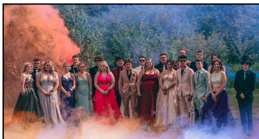
Photo above: Sturgis Composite grade 12 graduates have some pretty awesome photos.