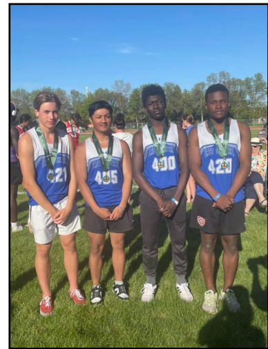
Photo above: The Intermediate Boys 100m Relay team proudly display their silver medals.