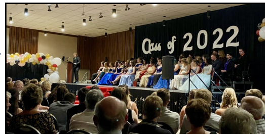
Photo above: Esterhazy High School held their graduation ceremony on June 28, 2022.