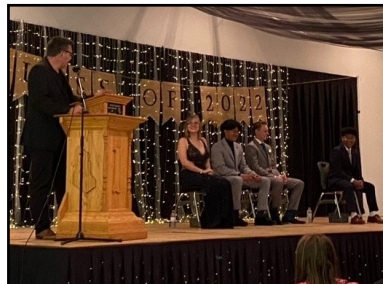
Photo above: Invermay School celebrated their graduates on June 29 with a face to face ceremony.