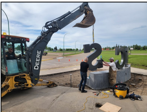
Photo above: Many hands make light work. The monument was completed thanks to many MCS' partners!

On July 1, 2022, Melville Comprehensive School celebrates their 50th anniversary. The 50th Graduating class will be able to take their picture at the new monument, the beginning of a new yet continued legacy.