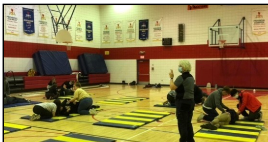
Photo above: Grade 10 students completing their First Aid certification.