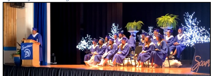
Photo above: Kamsack Comprehensive Institute live streamed their grad for anyone who was unable to attend in person.