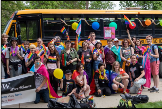
Photo above: Staff and students from GSSD who walked in the Queen City Pride Parade.

The Government of Saskatchewan proclaimed June as Pride Month in Saskatchewan: “this month is a time to celebrate 2SLGBTQ+ communities, and recognize the hard work and sacrifices of queer activists who have fought – and are still fighting – for equal rights”.