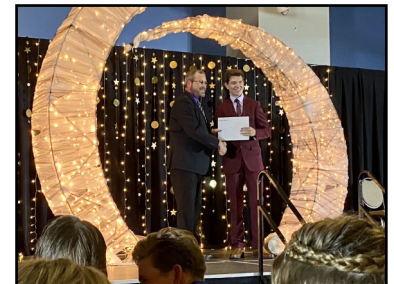
Photo above: Melville Comprehensive School grad 12 graduation ceremony.